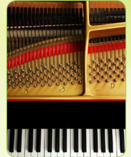
Residential high-end LifeStyle Collection

It is noteworthy that LAMBTON DOORS has set up a rigorous system of standardization and control of its manufacturing procedures, that we offer exclusively doors of maximum endurance since the frame is entirely bonded to the core, that our doors are perfectly calibrated and that we use only composite wood such as laminated wood fiber. This explains why all of our products are guaranteed for life, regardless of the door structure.