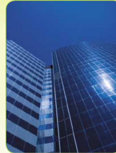
Commercial, architectural and institutional

LAMBTON DOORS has carried out many projects throughout North America as well as others internationally. We offer a vast choice of doors and frames for various types of construction: Government and military buildings, head offices, sports complexes, hospitals, hotels, condominiums and offices, schools, colleges, universities, banks and courthouses. We also offer a range of products for the high-end residential market.